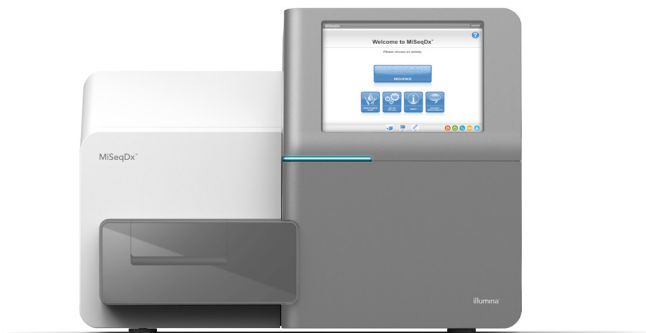
Figure 1: MiSeqDx Instrument—The FDA-regulated, CE-IVD–marked MiSeqDx Instrument offers a simple workflow, user-friendly software interface, and enhanced user security.

The MiSeqDx Instrument is the first Food and Drug Administration (FDA)–regulated and Conformité Européenne in vitro diagnostic (CE-IVD)–marked platform for next-generation sequencing (NGS) (Figure 1). Designed specifically for the clinical laboratory environment, the MiSeqDx Instrument offers a small footprint (0.3 square meters), an easy-to-use workflow, and data output tailored to the diverse needs of clinical labs. In addition, the on-instrument integrated software enables run setup, sample tracking, user management, audit trails, and results interpretation.* Taking advantage of proven Illumina sequencing by synthesis (SBS) chemistry, the MiSeqDx Instrument provides accurate, reliable screening and diagnostic testing.