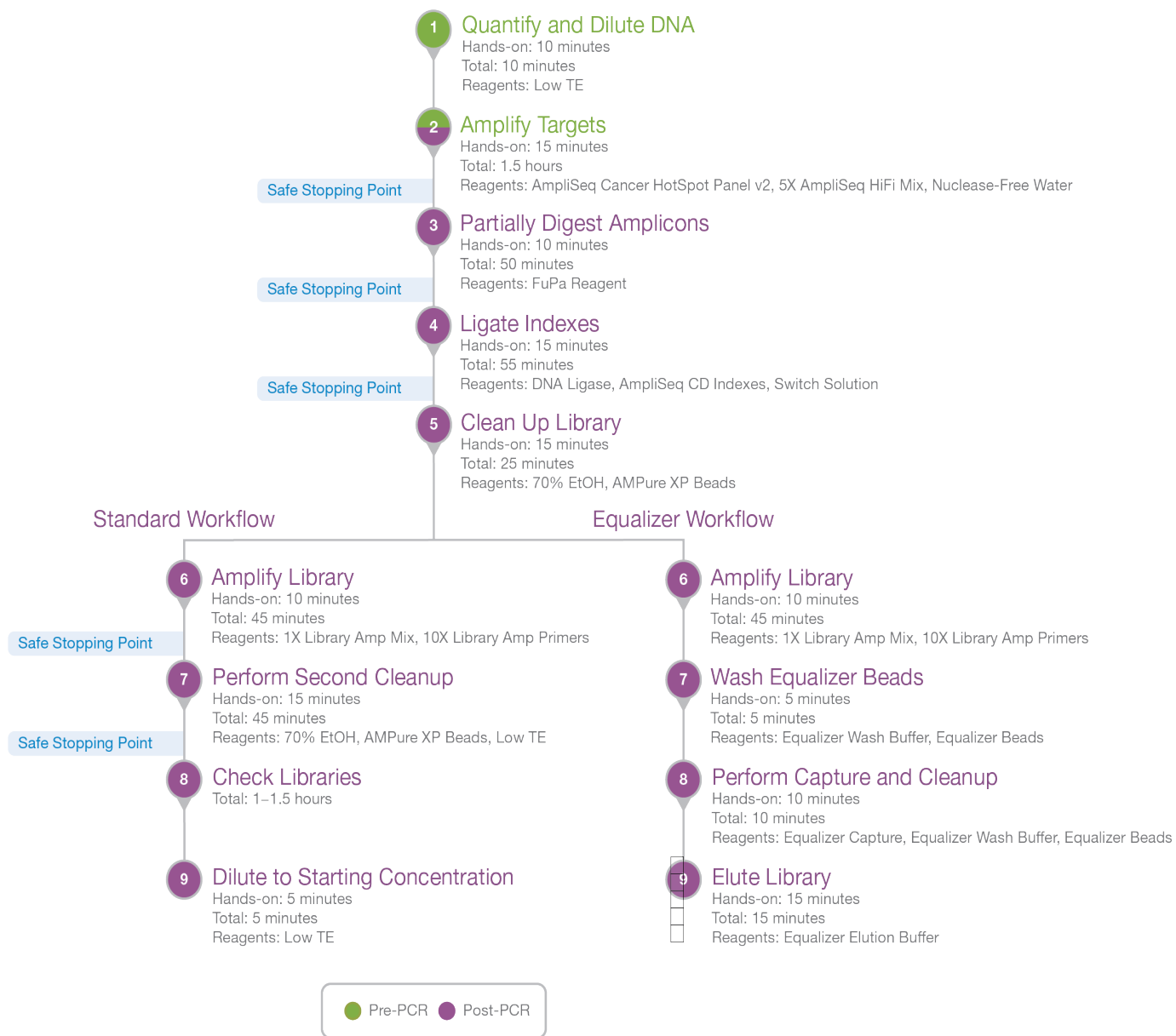
Figure 1 AmpliSeq Cancer HotSpot Panel v2 Workflow

The following diagram illustrates the AmpliSeq for Illumina Cancer HotSpot Panel v2 workflow. Safe stopping points are marked between steps.