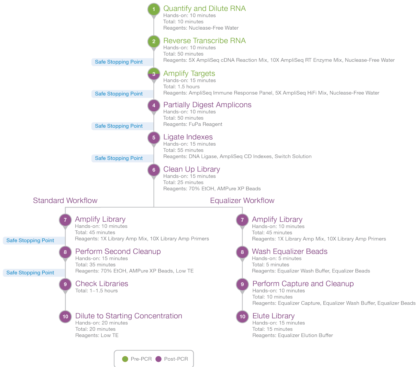
Figure 1 AmpliSeq Immune Response Panel Workflow

The following diagram illustrates the AmpliSeq for Illumina Immune Response Panel workflow. Safe stopping points are marked between steps.