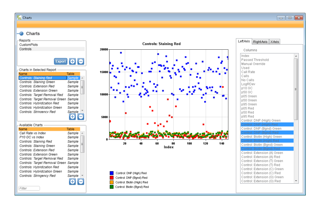
Figure 3: Quality control visualization—Beeline Software generates various charts for visualization of QC performance. Charts can be saved in PDF format for viewing outside of the software.