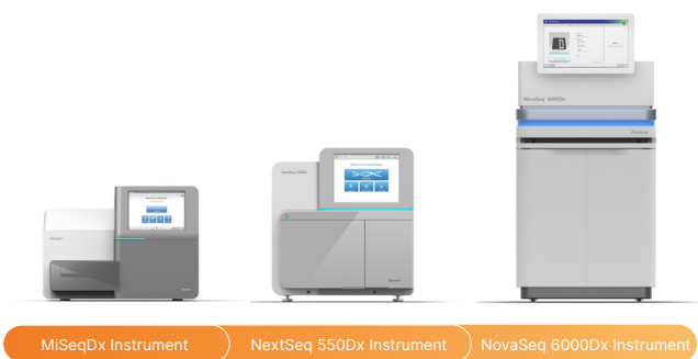
Figure 2: Optimized performance across validated platforms— These FDA-regulated, CE-marked IVD instruments offer user-friendly interfaces, enhanced security, and high-quality results for clinical applications.

Illumina DNA Prep with Enrichment Dx is compatible with the MiSeq™Dx, NextSeq™ 550Dx, and NovaSeq™ 6000Dx Instruments (Figure 2). These FDA-regulated and Conformité Européenne in vitro diagnostic (CE-marked IVD) platforms are designed specifically to bring the power of NGS to the clinical laboratory. Taking advantage of proven Illumina sequencing by synthesis (SBS) chemistry, these instruments provide highly accurate and reliable results for diagnostic testing.